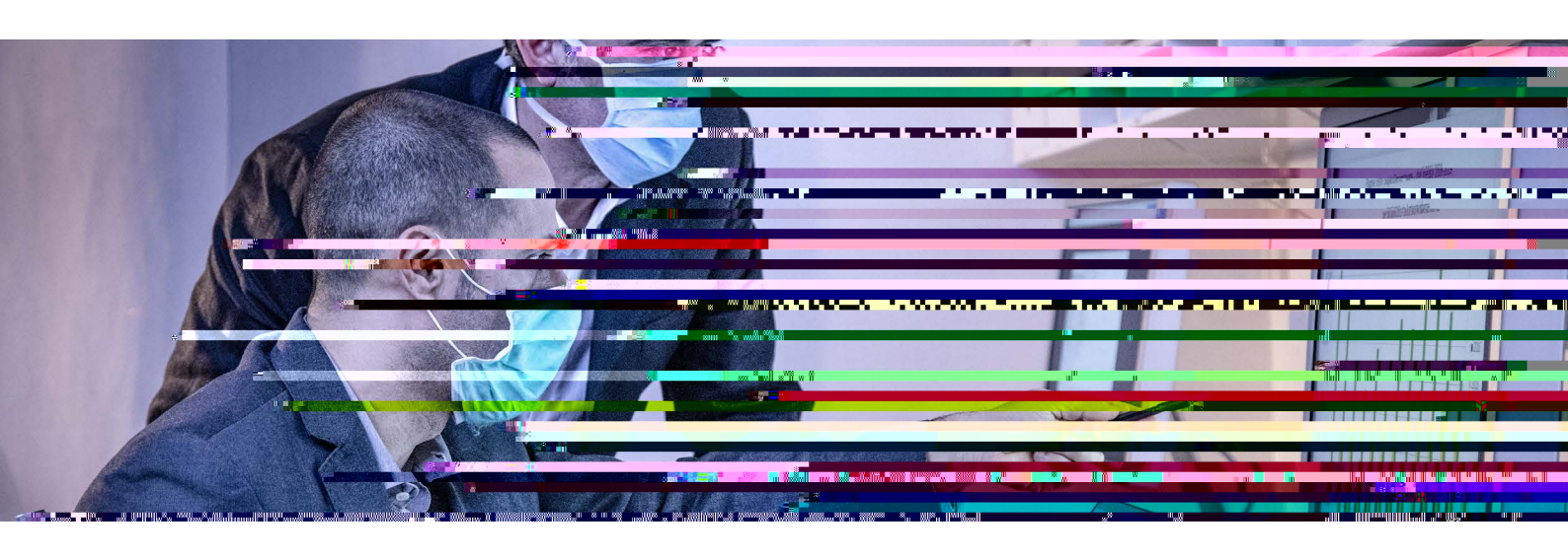
Returning to work following a pandemic: Employer considerations